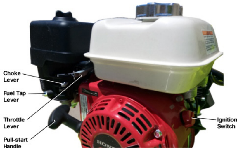
Figure 3 – Engine Start-up

If the FireAttack is not going to be used within the next few hours, shut the system down by turning the fuel tap to OFF.