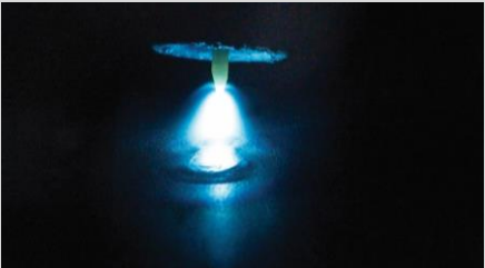
PAPR TRUE VISION LENS

The true vision lens featured on the MPAPR200 improves visibility and reduces eye strain by minimising the traditional lime green colouring in the viewing screen.